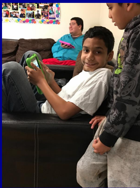
-The boys working on their reading skills-

charity with the CFC. You can have Ivey Ranch listed as a recipient of funds through your employer.